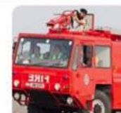
Fire Engine Rides