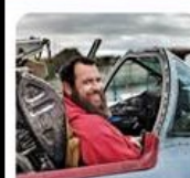
Climb in the Cockpits

| 13TH AND 14TH SEPTEMBER | 10AM TO 4PM | RAF MANSTON HISTORY MUSEUM CT12 5DF