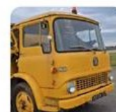
Loads of Vehicles